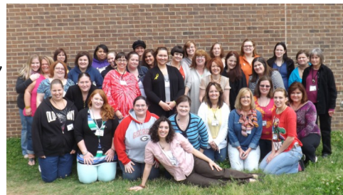
2013 BMB Retreat Attendees

Next year, we'll celebrate our 10 th annual Birthmom Retreat! Double digits! Because this will be a big celebration of that accomplishment, we are already making plans for next year's festivities. So mark your calendars now (May 2 – 4, 2014) and start saving those pennies to attend! Since we are already preparing for the retreat next year, if you'd like to assist in preparation for next year's retreat now is the time to let us know. Email us at birthmombuds@gmail.com .